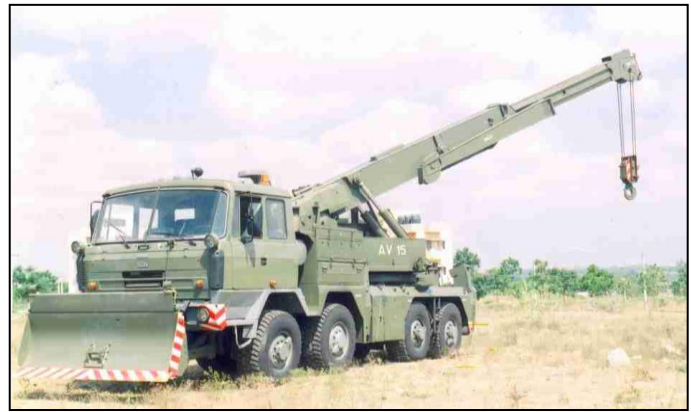
HEAVY RECOVERY VEHICLE-HRV