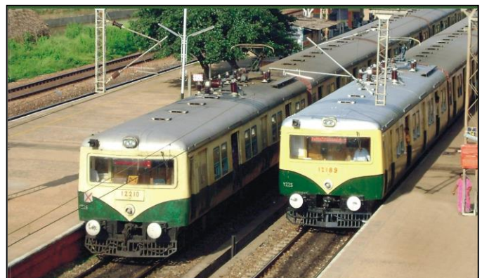
ELECTRICAL MULTIPLE UNITS