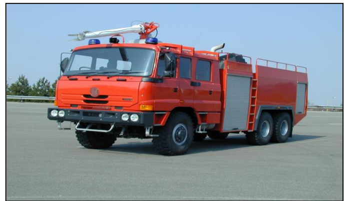
CRASH FIRE TENDER