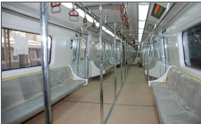
INTERIOR OF METRO TRAIN