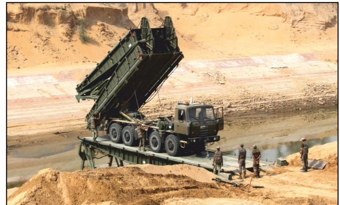
SARVATRA BRIDGING SYSTEM