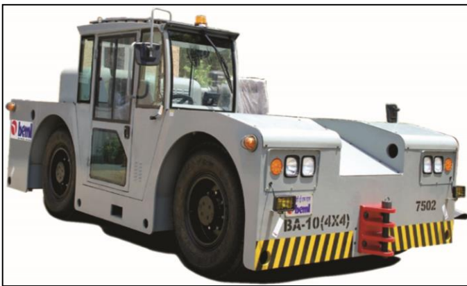
AIR CRAFT TOWING TRACTOR