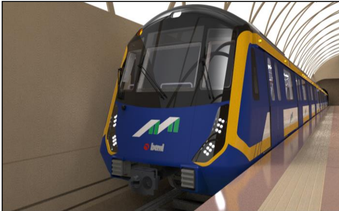
UTO / DRIVERLESS METRO CARS