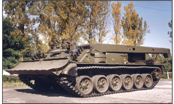
ARMoured RECOVERY VEHICLE