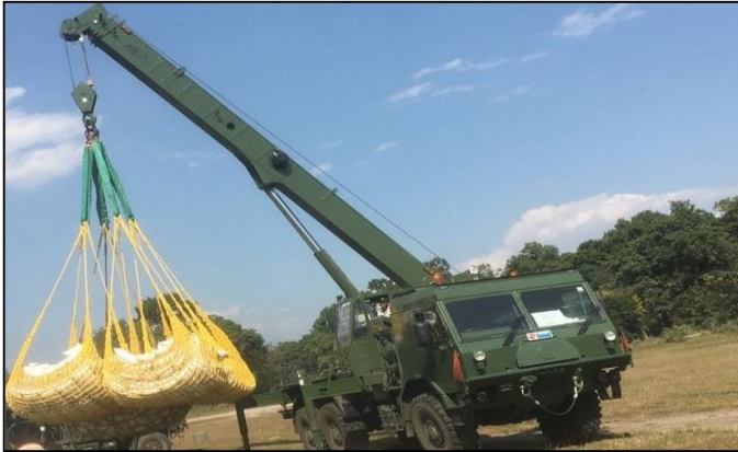
BEML -TATRA HIGH MOBILITY TRUCK 6X6