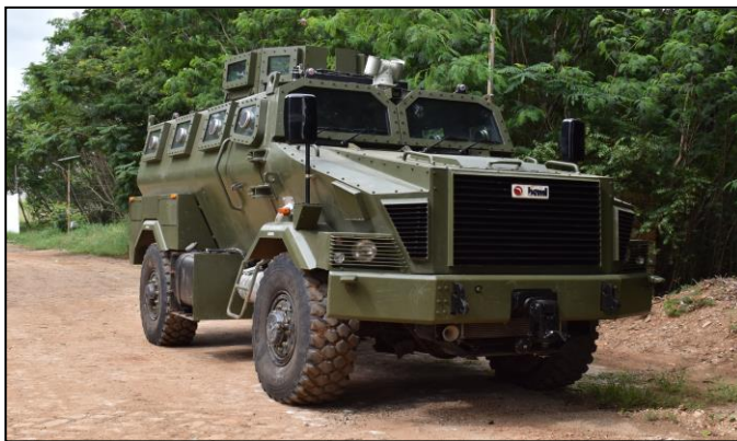
MEDIUM BULLET PROOF VEHICLE