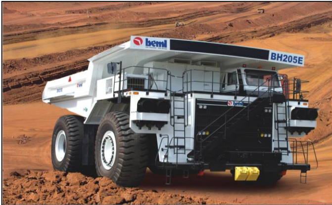
DUMP TRUCKS-ELECTRIC DRIVE