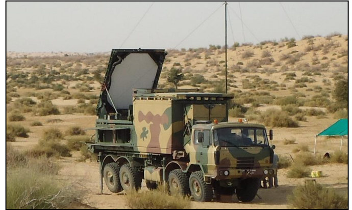
BEML -TATRA HIGH MOBILITY TRUCK 8X8