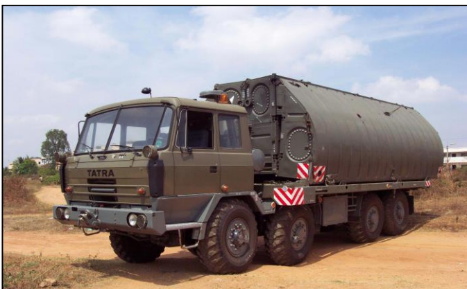
PMS BRIDGING SYSTEM