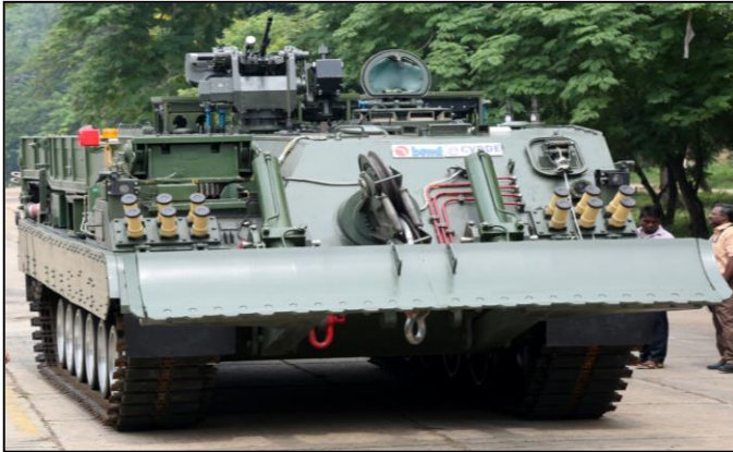
ARJUN ARMoured REPAIR & RECOVERY VEHICLE